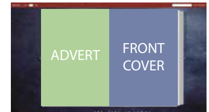
option 3 + inner cover